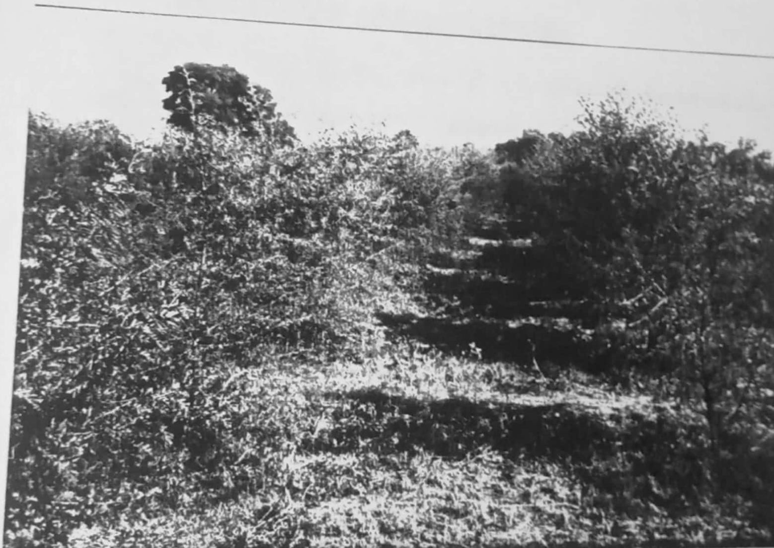
Seed Orchard of Acacia nilotica at Bhagat- April, 1987.