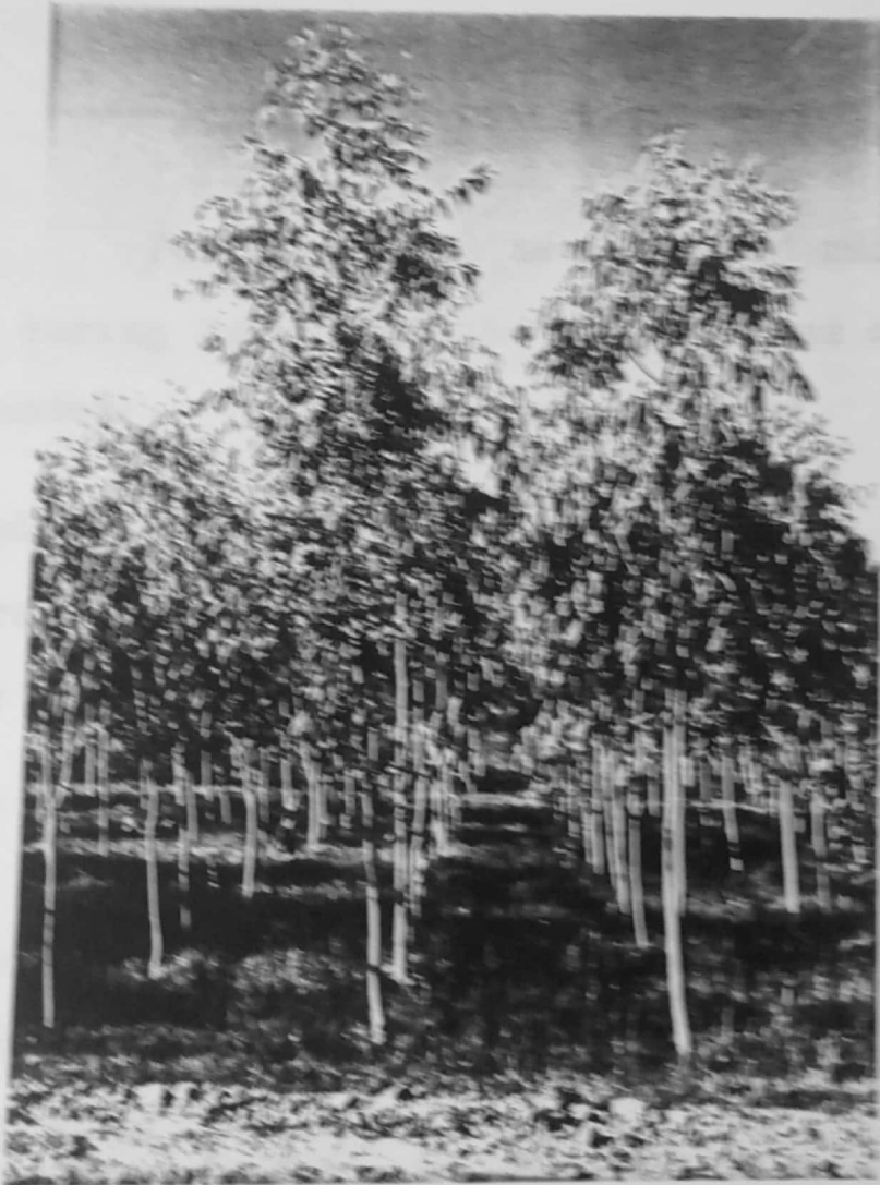
Seed Orchard of Eucalyptus canaldulensis