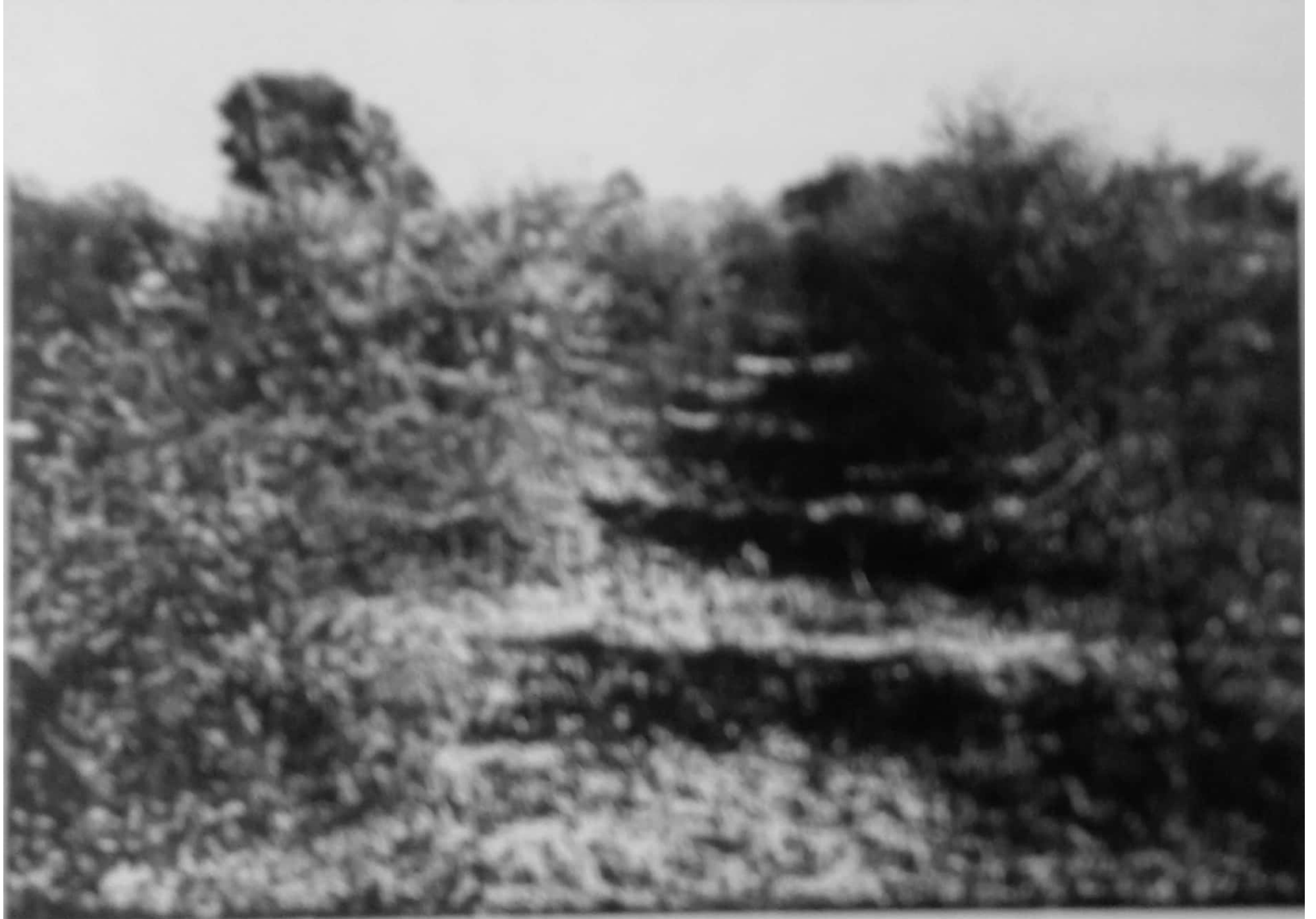
Best Orchard of Apple miltaria