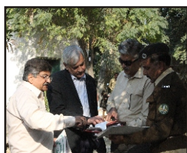
Discussing in field, Mianwali