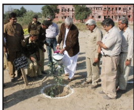
Planting a sapling at Danish School Mianwali