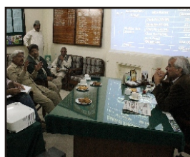
Getting Briefing from DFO Bhakkar