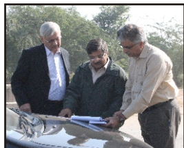
Discussing in field, Sargodha Forest Division