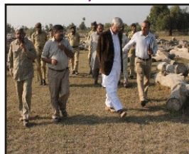
Kaloor Kot Forest Depot