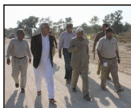
Danish School, Mianwali