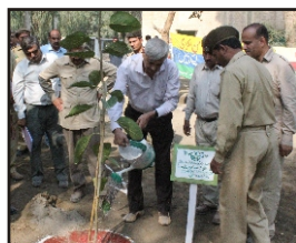
Planting a sapling at Fateh Major Plantation