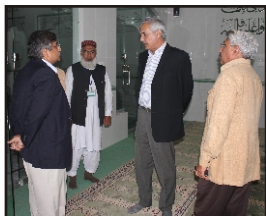
In "Masjid Rahim" Sargodha Forest Complex