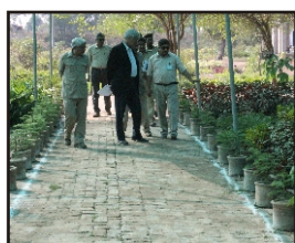
Model Nursery Sargodha