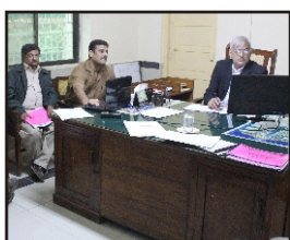
Getting briefing from DFO Mianwali