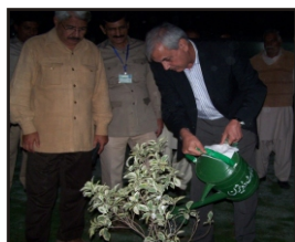
Planting a sapling at Sargodha Forest Complex