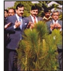
The Prime Minister of Pakistan Syed Yousaf Raza Gillani offering prayers after Inaugurating the Spring Tree Planting Campaign 2012 at the Prime Minister House