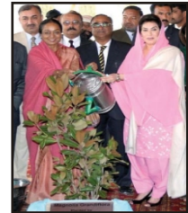
Speaker Indian Parliament 'Lok Sabha', Meira Kumar along with General Punjab, inaugurating the spring tree planting campaign 2012 by planting a tree in front of the Parliament House.