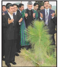
Presidents Mahmood Ahmadinejad and Hamid Karzai and Prime Minister Syed Yousaf Raza Gillani pray after planting a sapling to mark inauguration of the summit.