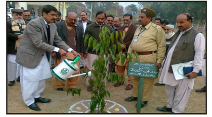
Malik Ahmad Ali Olakh, Minister for Forests, inaugurating the Spring tree planting campaign 2012 by planting a sapling at the Circuit House, Multan