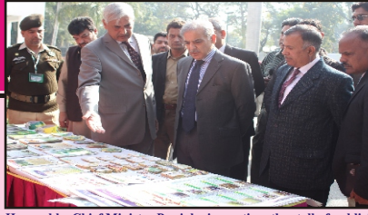
Honorable Chief Minister Punjab, inspecting the stall of publicity material along with Secretary Forests