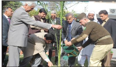
Honorable Chief Minister Punjab, planting tree to inaugurate the Spring Tree Planting Campaign 2012